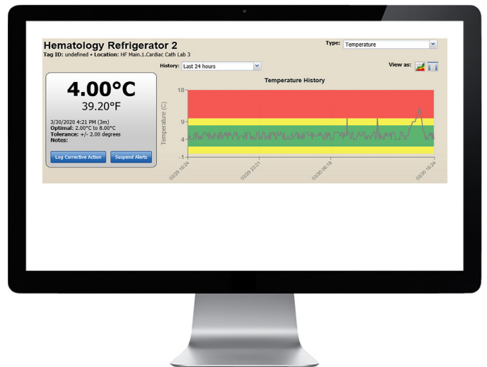
View the temperature history of specific units over a designated period of time.