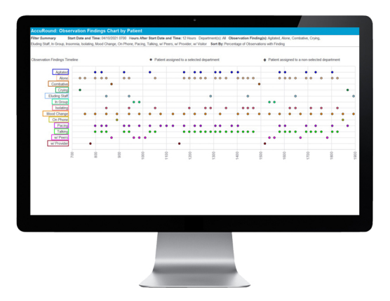
Drill down into each individual patient record to analyze clinical observation findings.