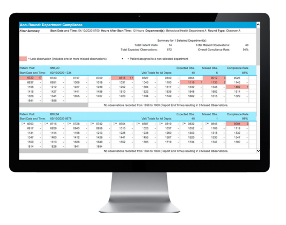
View a summary of individual patient and department compliance statistics.