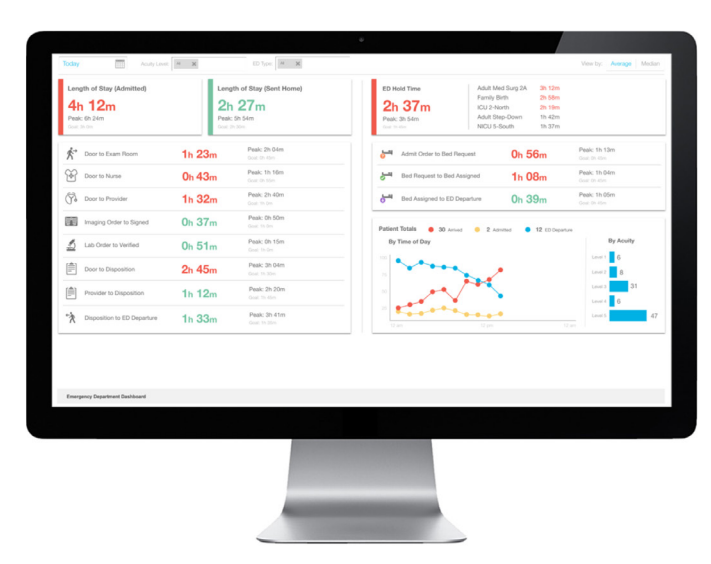
Gain immediate visibility into bottlenecks causing delays in care.

Emergency department dashboards allow staff to see arrivals, admits, and departments by time of day and acuity. They also let personnel drill into specific units causing delays in care or transitions. Additionally, dashboards enable views of average, peak, and target length of stay by patients being admitted versus those sent home.