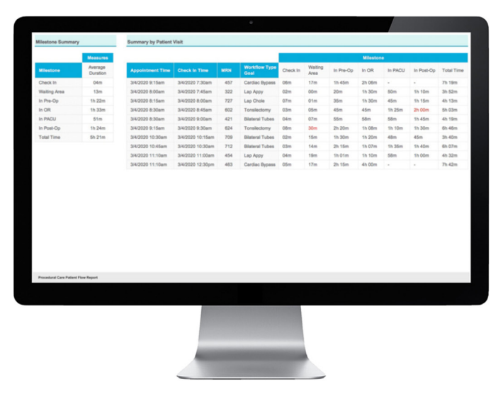
Identify trends and patterns in patient throughput metrics over periods of time. Drill in to understand the moment-by-moment details of each patient's visit.

Patient flow reporting generates a better understanding of how long patients are spending in each milestone of care from check in to discharge or disposition, or across each milestone of their procedure. Leaders gain greater visibility around the moment by moment details of each patient's visit, as well as identifiable trends and patterns in patient care metrics over time.