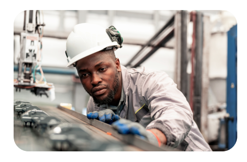
Accelerate the flow of work with Al-driven workflows that empower every user, maximizing productivity and impact exactly where they work.