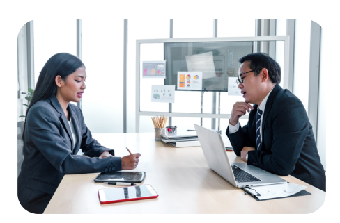
Enhance productivity and financial resilience by unlocking Al-driven insights into operational efficiency across the supply chain.